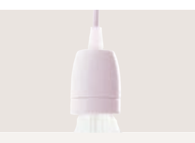
€ Material: Porcelain Cable Clamp: Conical in Thermoplastic Fitting: E27

Porcelain E27 lamp holder Measurements: Ø 45 mm, h 60 mm