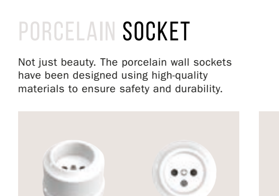
French porcelain wall socket Measurements: Ø 65 mm, h 50 mm